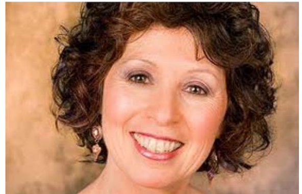
Israeli storyteller Noa Baum uses the art of storytelling as a peacemaking tool