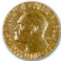
In 1947, AFSC was a co-recipient of the Nobel Peace Prize, for our work "...from the nameless to the nameless...." on behalf of all Quakers.

The American Friends Service Committee (AFSC) has initiated a new program which encourages each Meeting to designate an AFSC Liaison as a direct connection between an individual Quaker meeting and AFSC. The Goals of the AFSC Meeting/Church Liaison program are a) to inspire involvement in AFSC's programs; b) to build support and awareness of AFSC's work region-