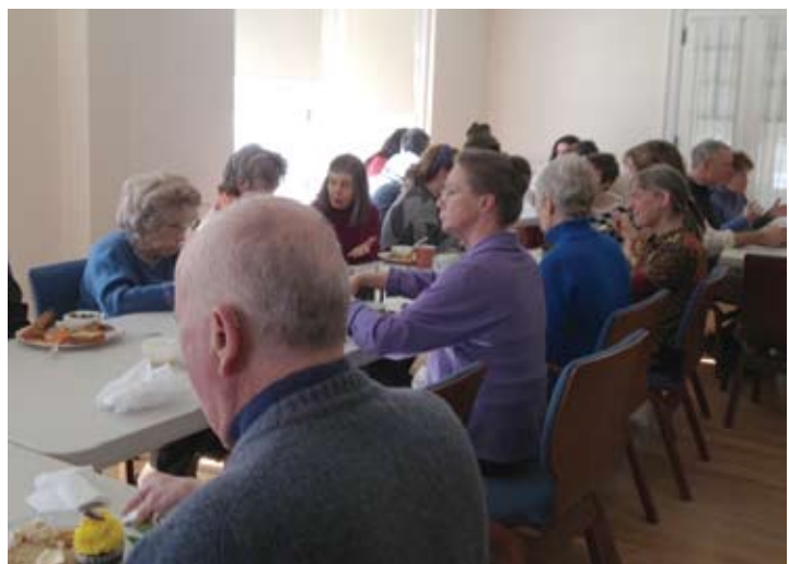
Worcester Friends Meeting is known as the Meeting for Eating because of our weekly pot luck lunches at the rise of theMeeting. January 27th, we were delightfully filled to capacity!