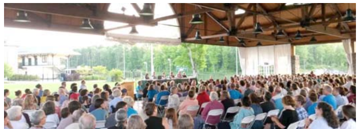
Opening meeting at NEYM Sessions 2014

My eyes always leak when, on the last day of sessions, we "sing the children and Young Friends in." NEYM is blessed to have wonderful Friends caring for our children. It makes attending NEYM Annual Sessions easy.