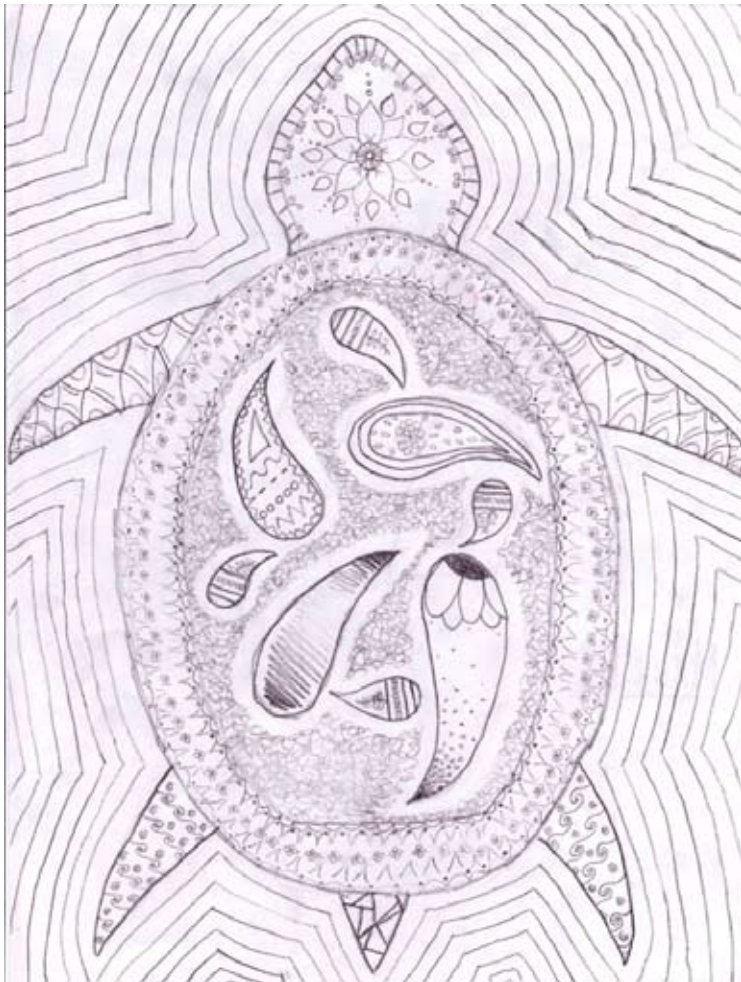
Turtle line drawing by Maye Costello-Walsh.