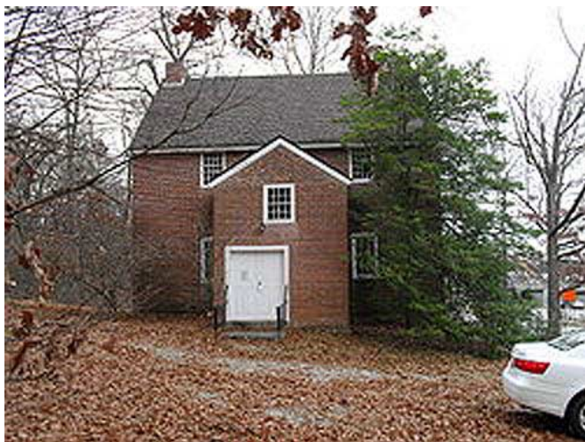
Friends Meeting House, Uxbridge, MA, 1770, Route 146A and Route 98; National Register of Historic Places