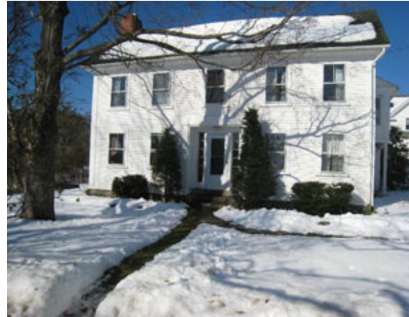
New England Yearly Meeting's Ministry & Counsel held their November meeting in the Bliss House at the Meeting School. This photo was taken in late October.

I came to Quakers with the Belief that we can make a better world. I left this M&C retreat with the belief that we are part of a greater movement which is part of a greater story.